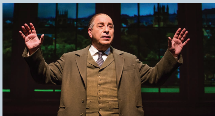
Following New York debuts, Martin Luther on Trial (left) and The Most Reluctant Convert continue engaging audiences on national tour.