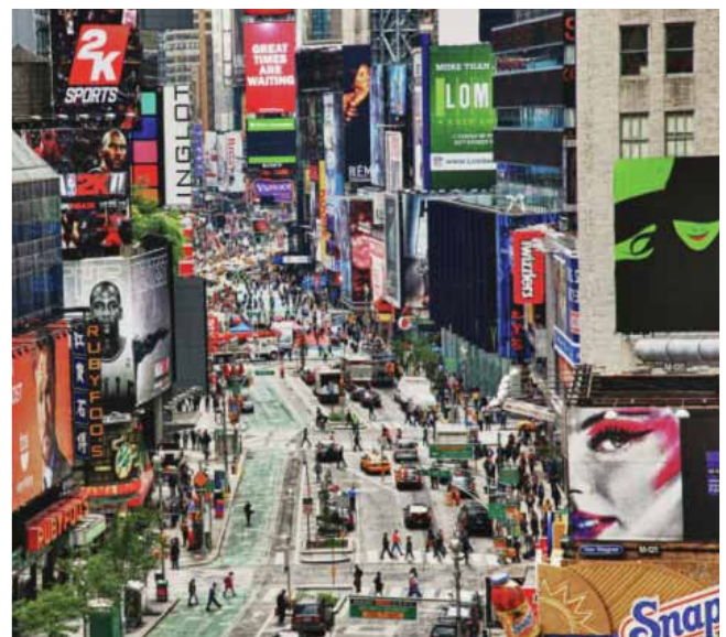
Times Square from outside FPA's new offices on Broadway.